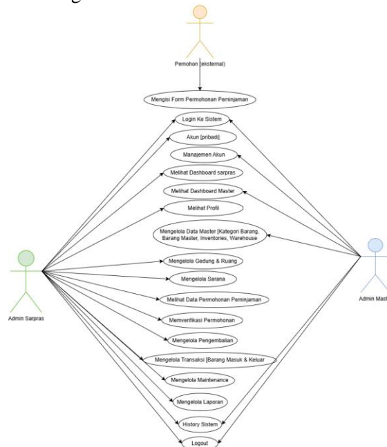
Figure 2. System Design Diagram

The system was designed to manage facility data, borrowing and returning processes, maintenance records, and reporting features in an integrated manner.