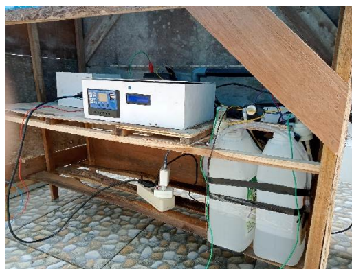
Figure 4. Tool assembly results

The following is a picture of the assembly of tools that we have previously designed. The container for nutrient water uses a 1.5L jerry can, the pump and water flow sensor are placed on top of the jerry can with wood as a support for the water flow sensor