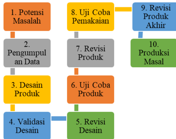
Figure 1 Borg and Gall Development Model

The research method used is research and development (R&D), referring to the development model presented by Borg and Gall (Sugiyono, 2010), which is carried out by following ten stages of development to produce a final product that is ready to be applied, can be seen in Figure 1. The subject of the research is a material expert, a media expert.