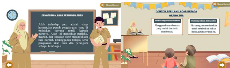
Gambar 9 Halaman Materi 2 Gambar 10 Halaman Contoh Materi 1