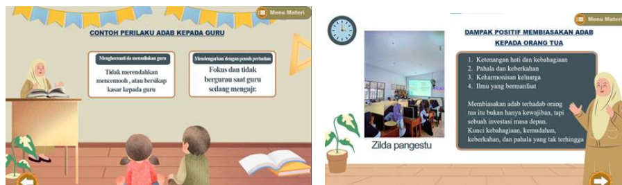
Gambar 11 Halaman Contoh Materi 2 Gambar 12 Halaman Dampak Materi