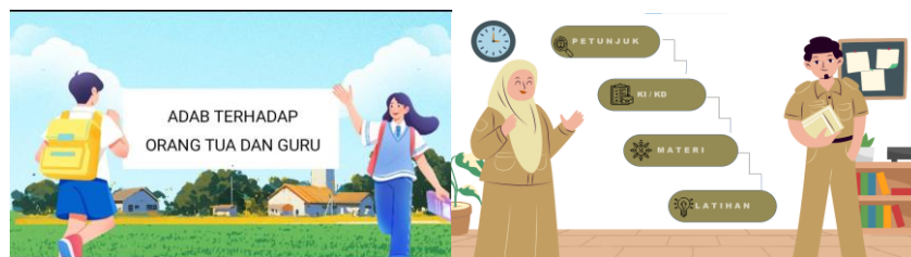
Gambar 1 Sebelum Evaluasi Gambar 2 Sesudah Evaluasi

The researcher completed the learning media product based on expert advice and input, both from media expert validation and material expert validation. After revisions, the researcher presented the final product in the form of images. Figure 1 shows the profile page, while Figure 2 displays the menu page. Both images are part of the final product in the development of PowerPoint-based learning media.