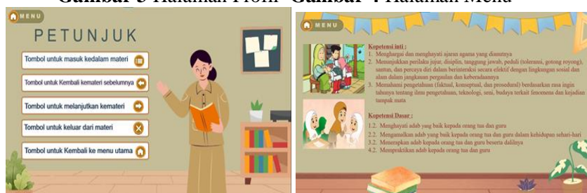
Gambar 5 Halaman Petunjuk Gambar 6 Halaman KI/KD