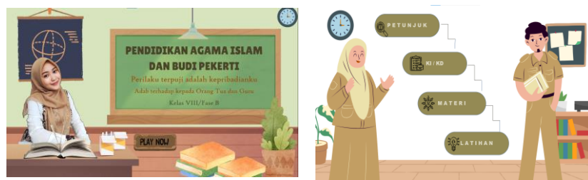
Gambar 3 Halaman Profil Gambar 4 Halaman Menu

Researcher have completed the development of a PowerPoint-based learning media product in accordance with the suggestions of media and content experts. After undergoing a revision process based on the validation results, researchers then presented the final results in the form of images. Figure 4 shows the profile page, while Figure 3 displays the menu page. Both images are part of the final product that has been developed.