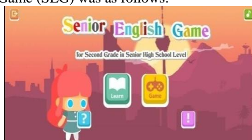
Figure 1. Menu Product

Based on the results of material validation, media validation and implementation, it shows that the Senior English Game (SEG) media can be added as learning media for students to practice reading and writing both at school and anywhere. SEG can be said suitable to use as learning media English at MA Mambaul Ulum because the material in Senior English Game (SEG) is an accordance with the curriculum in the school so that Senior English Game (SEG) can to use in school as a learning media to develop reading and writing skill. The researchers showed the layout drawing after it was revised. The layout drawing of the Senior English Game (SEG) was as follows: