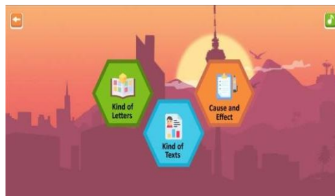
Figure 2. Kind of Materials