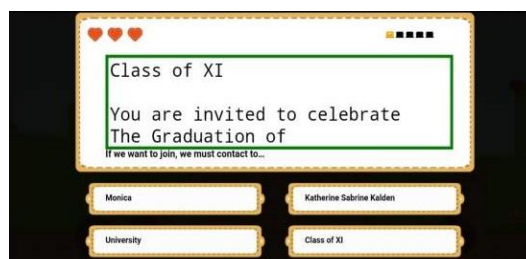
Figure 6. Result of Game