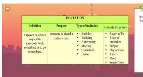
Figure 4. Material