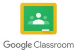
Figure 1. Google Classroom Application Icon

class on the Google Classroom is filled by members according to the real class, so that the virtual class design remains as usual.