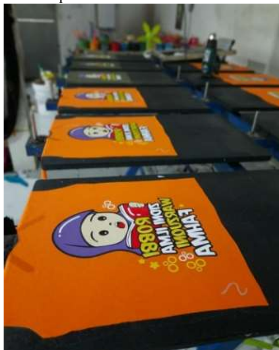
Figure 1. Children's Clothing Innovation Products

Production Strategy in Faiz Konveksi is done by making new breakthroughs about the variety of clothing models produced and innovations. Variations of clothing models that have become the latest innovations are presented in Figure 2. Through product innovation, Faiz convection experienced an increase in orders that many things are seen from the results of sales of its products. New innovations are tailored to the needs of society and the latest developments in the fashion world. In addition, the quality of raw materials plays an important role in the production process of goods. This is done in line with the results of research (Jayanti Mandasari et al., 2019) which is to keep the product in demand by consumers and have competitiveness towards competitors.