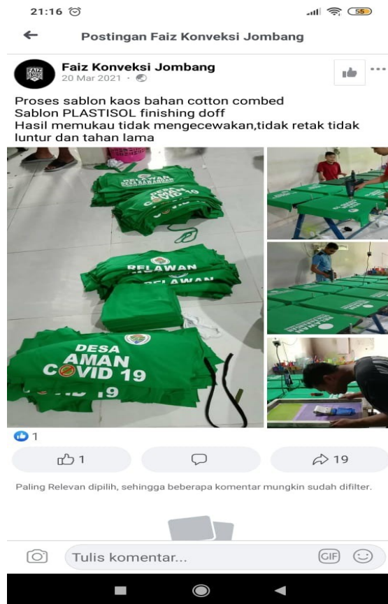
Figure 3. Promotion via Social Media (Facebook)

Distribution strategy in Faiz Konveksi is done by using courier services in the delivery of goods (Figure 4).