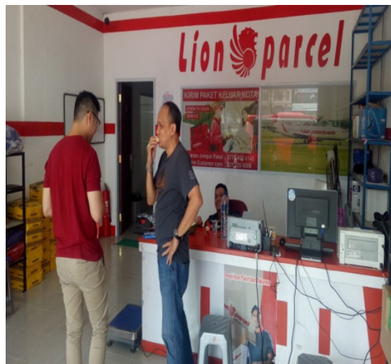
Figure 4. Use of Courier Services in Product Distribution

Distribution strategy in Faiz Konveksi is done by using courier services in the delivery of goods (Figure 4).