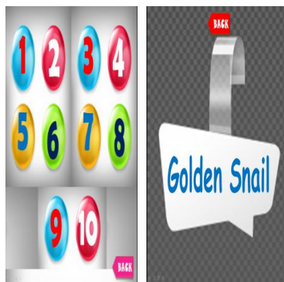
Figure 10 Example of content exercise