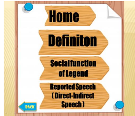
Figure 5 Example content of "one of them sub chapter"