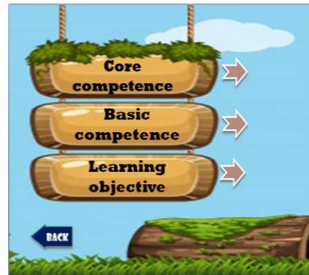
Figure 6 Example content of "Home"