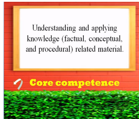
Figure 7 Example content of home