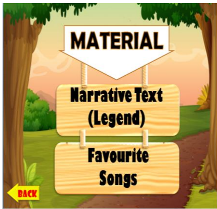
Figure 3 content of the material