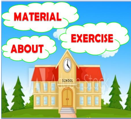
Figure 2 Menu application