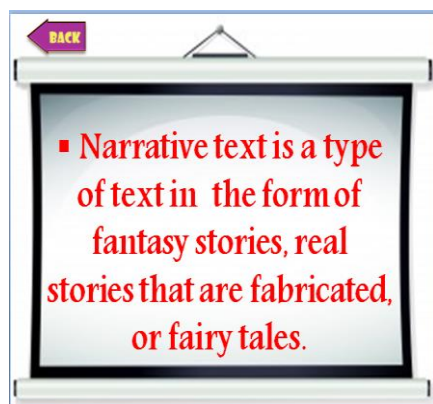
Figure 8 Example content of "Definition" feature