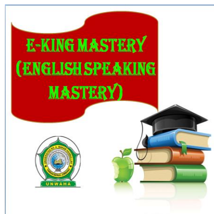
Figure 1 Initial view of application

The part of final product the researcher showed the figure of layout after revisions. The layout figure of E-KING (English speaKING) Mastery as follows :