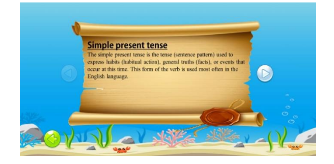
Figuer 5. Materials layout

The grammar material consists of several slides and there are two right and left buttons on the material