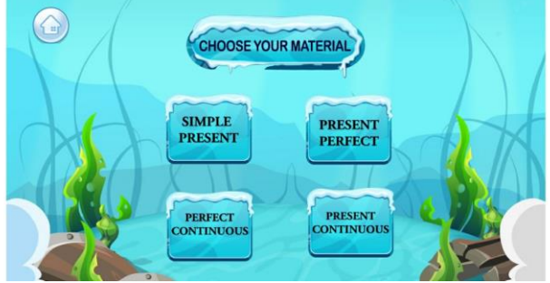
Figure 4. Menu of Materia Simpresent

This product mainly consists of four material buttons on English grammar, namely Simple present, present continuous, present perfect, perfect continuous.