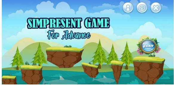
Figure 2. Logo of Simpresent Application

The Researchers used a bright background on the logo to give users focus on the title of this product.