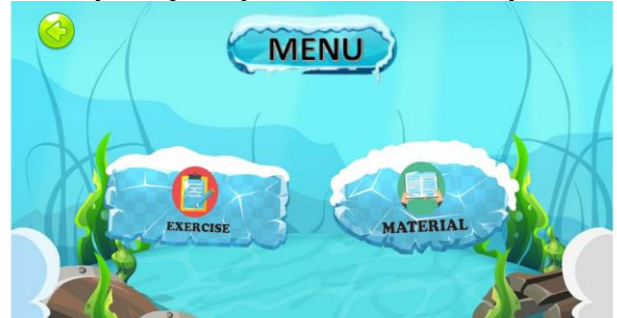
Figure 3. Layout Menu

The layout of the "Simpresent" application was menu layout, learn grammar menu, materials or learn grammar menu layout, direction layout, quiz layout, and final score layout.