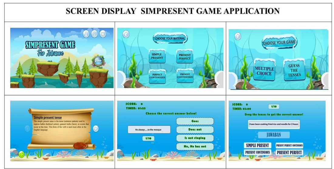
Figure 8. Final of The Product

The researcher had been finished the product according to the suggestion by the media experts after the media and material experts have validated it.