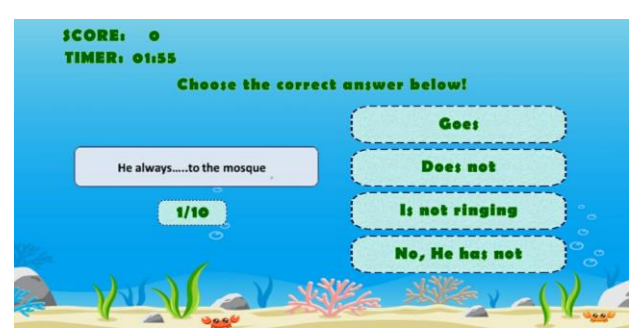
Figure 6. Layout of Quiz