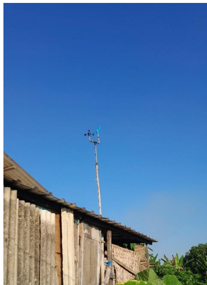
Figure 3 Installation of wind speed and cardinal direction sensors