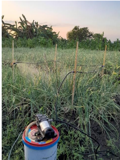
Figure 4 Pump system and whole automatic spray in the field