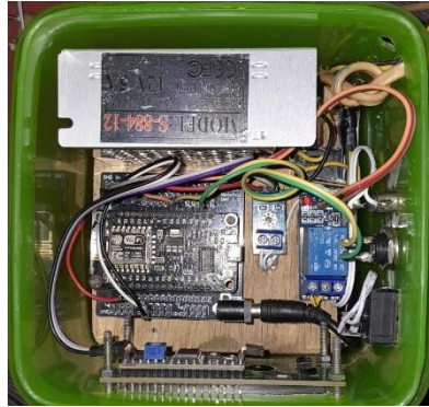
Figure 2 Final Assembly System

the breadboard. The system is designed to work independently in the open field with a power source from a 12V power supply and a battery as a backup.